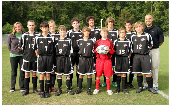
2008 Hopewell Academy Soccer Team

With only two games left in the season including the CCAL play-offs, the Tigers are looking to finish strong. So far this season the Tigers have faced East Wake, Woods Charter and Camelot